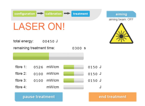
Easy dose calibration with a simple and intuitive touch-screen UI