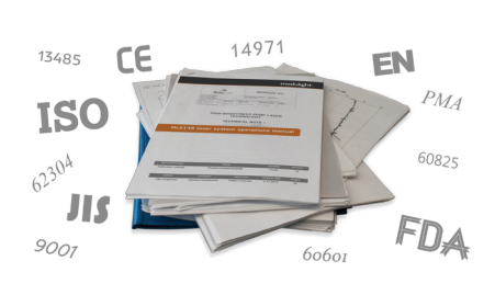
Modulight has experience in making all necessary paperwork for regulatory approvals