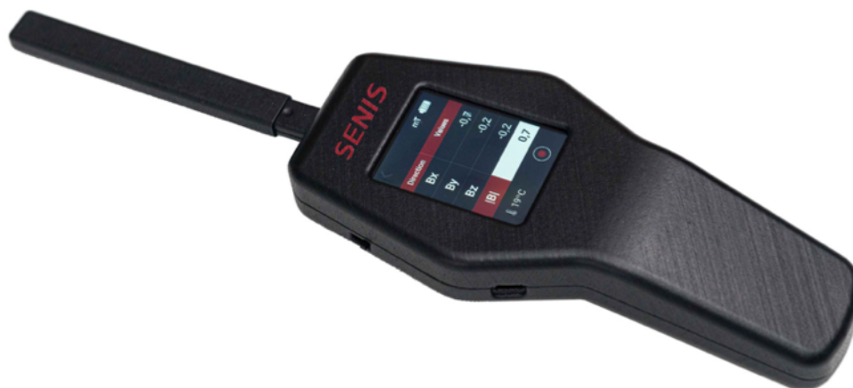
Figure 1: SENIS 3MH1 Handheld Teslameter

Due to unique features of the applied fully integrated 3-axis Hall probe, all three components of the magnetic field ( B_x , B_y , B_z ) are measured simultaneously at virtually same point. It allows users to perform a fast, high-resolution measurement of magnetic flux density of the magnetic fields. The measured values are presented on the device touch-display. The magnetic field sensitive area of the applied Hall probes is within a 100\ \mu\text{m} \times 100\ \mu\text{m} square, which allows measurements of homogeneous and highly inhomogeneous magnetic fields.