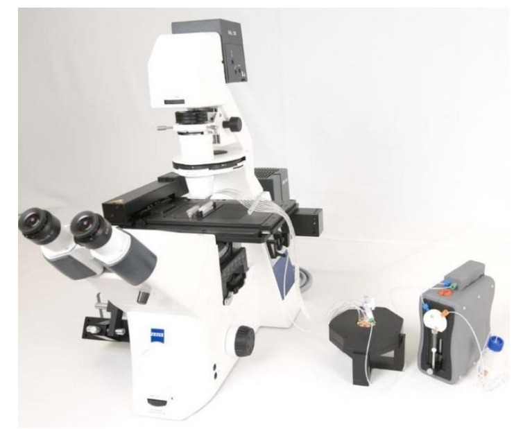
Mirus Evo nanopump and MultiFlow8 connected to a Vena8 biochip on an inverted microscope