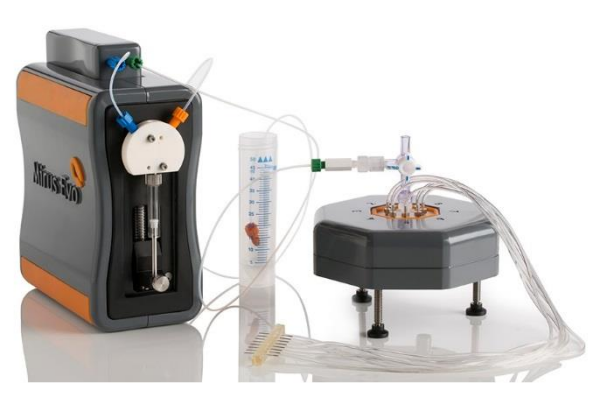
Mirus Evo nanopump and MultiFlow8

Includes MultiFlow8, a manifold that enables the flow from the Mirus Evo to be split equally into 8 separate tubes to conduct 8 assays simultaneously in the Vena8 range of biochips, resulting in higher throughput with this 8-channel syringe pump. Mirus Evo is PCcontrolled by VenaFluxAssay software.