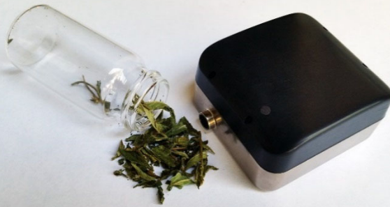
Belt-Wearable™ FR-2 Smart Drug Sensor