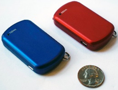
Nano-LB™ Smart Drug Sensor