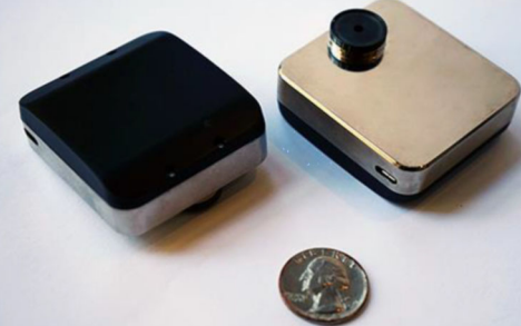
Belt-Wearable™ Smart Drug Sensor