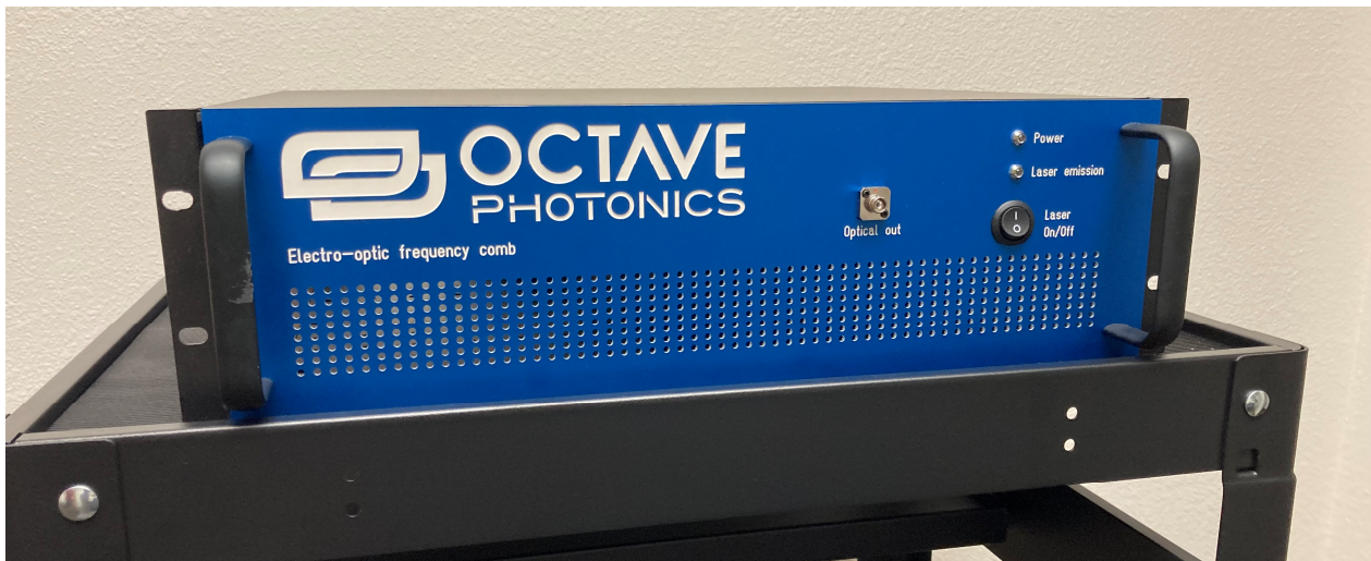
Figure 1. 19-inch rack-mount Base EO comb.

Summary: Electro-optic laser frequency combs (EO Combs) from Octave Photonics provide a reliable method for generating femtosecond frequency combs at repetition rates between 5 and 30 GHz. Octave Photonics specializes in building EO combs with ultra-low phase noise, octave-spanning bandwidth, and femtosecond pulse durations. Applications include spectrograph calibration and dual-comb spectroscopy.