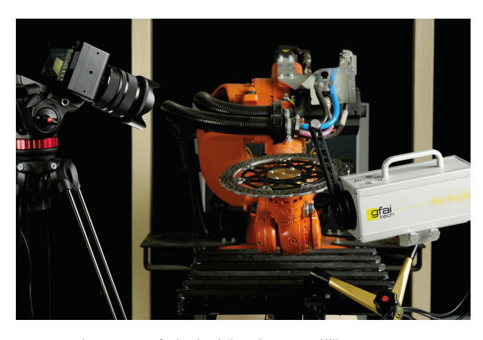
Automated excitation of a brake disk with WaveHit ^{\mathrm{MAX}}