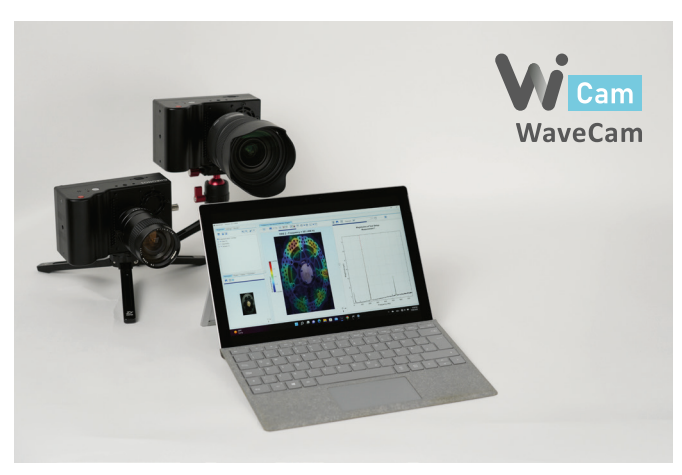
Highspeed cameras Chronos 1.4 and 2.1 with WaveCam software by gfai tech

Optical flow based time and frequency ODS