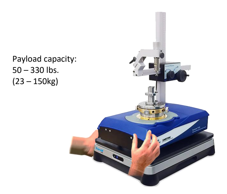
Figure 3-6 Center and level equipment on top plate

Step 4 Ensure power is OFF. Place, center and level equipment payload on top plate.