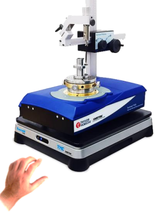
Figure 3-7 System automatically levels top plate

Step 5 Press power switch ON when no external transient events are expected for 3-5 minutes.