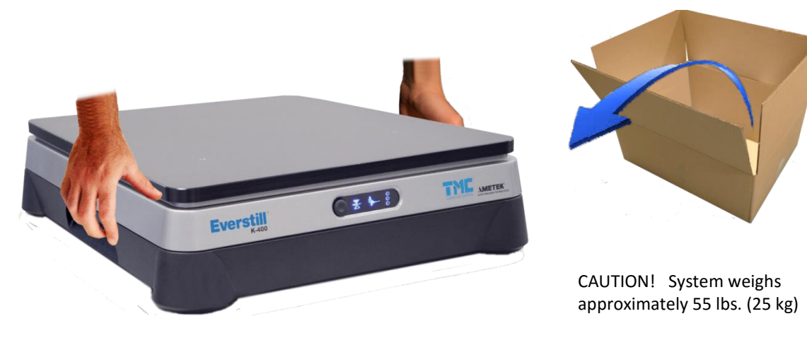
Figure 2-1 Unpacking system

IMPORTANT! Ensure to always lift system by two side handle inserts when unpacking or moving system.