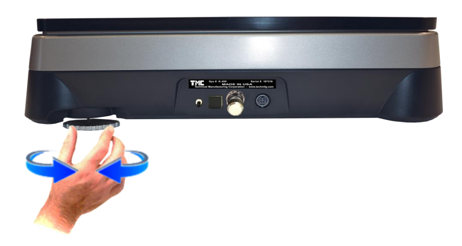
Figure 3-4 System level adjust

Step 2 Rotate rear corner level adjust to ensure all four corners sit flat on rigid surface.