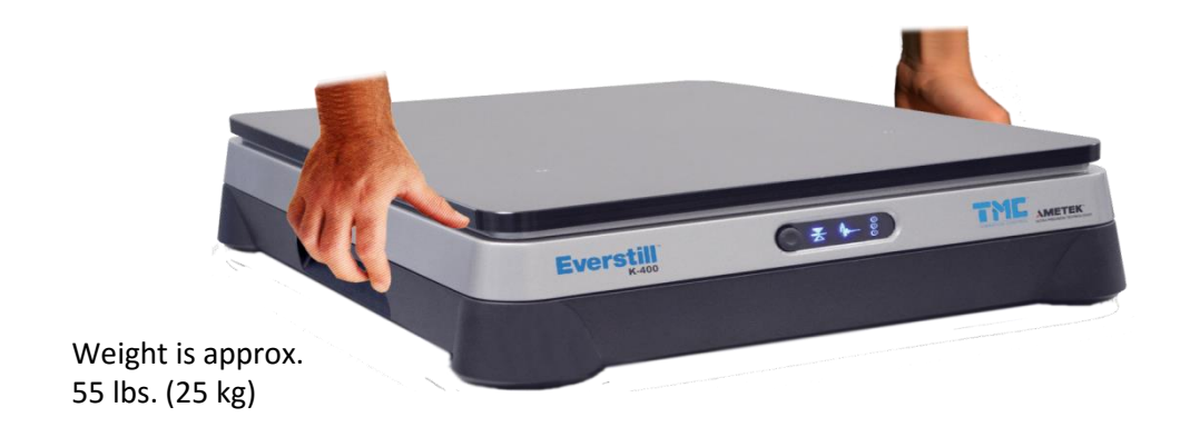
Figure 3-3 Place system on rigid flat surface

Step 2 Rotate rear corner level adjust to ensure all four corners sit flat on rigid surface.