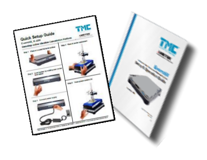
Figure 2-2 Shipping Package Content

Setup & Operations Guide and Quick Setup Guide