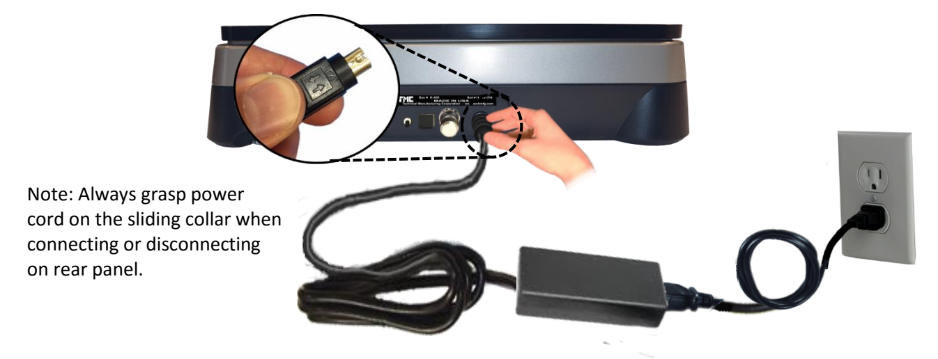
Figure 3-5 Connect external power supply

Step 4 Ensure power is OFF. Place, center and level equipment payload on top plate.