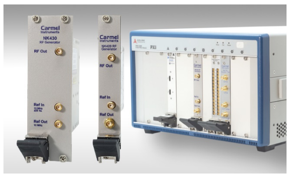
NK420 and NK430 With PXES-2590 Chassis