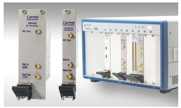
NK420 and NK430 With PXES-2590 Chassis