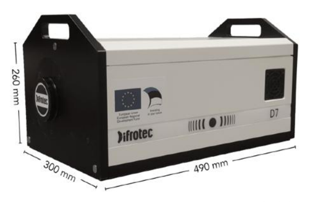
D7 is compact, reliable, and easy to use