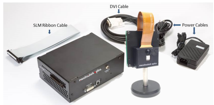
E512 LCoS SLM System Contents

16-bit images can be transferred across the DVI interface at a rate supported by the graphics card used (60 – 200 Hz). With 16-bits of analog voltage resolution, the SLM can be used to easily obtain more than 1000 linear resolvable phase levels. This \lambda/1000 phase resolution can be maintained over a broad wavelength range by tuning the look-up-tables / calibrations for your incident wavelength.