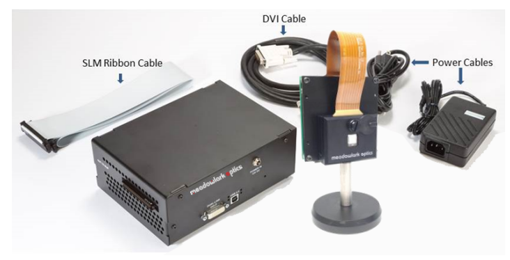
E512 LCoS SLM System Contents

16-bit images can be transferred across the DVI interface at a rate supported by the graphics card used (60 – 200 Hz). With 16-bits of analog voltage resolution, the SLM can be used to easily obtain more than 1000 linear resolvable phase levels. This \lambda/1000 phase resolution can be maintained over a broad wavelength range by tuning the look-up-tables / calibrations for your incident wavelength.