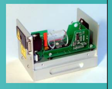
CoSy head from the inside