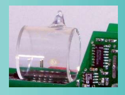
alkali spectrocopy cell