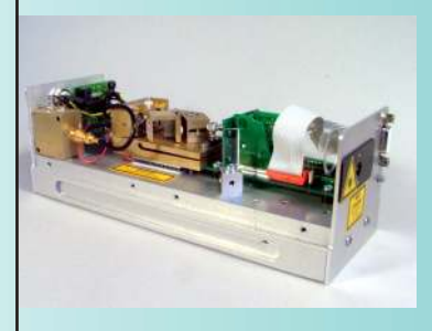
CoSy integrated into DL 100

The complete opto-mechanical setup, consisting of beamsplitters, mirrors, detectors, and the spectroscopy glass cell, is integrated in the CoSy measurement head. As the degree of absorption depends on the vapor pressure of the chemical element in the glass cell and therefore on its temperature, the CoSy head is equipped with a regulated cell heating.