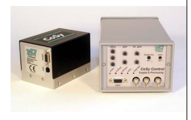
CoSy measurement head and CoSyControl electronics

Usually this is achieved by using a relatively complex opto-mechanical setup. The truly compact CoSy system contains this setup and also all the evaluation electronics needed to obtain a Doppler-free saturation spectrum as an output voltage directly observable on an oscilloscope.