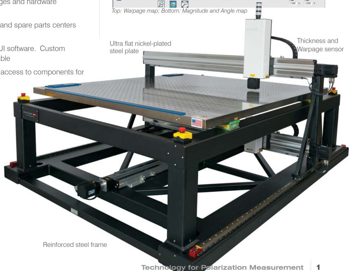
Reinforced steel frame