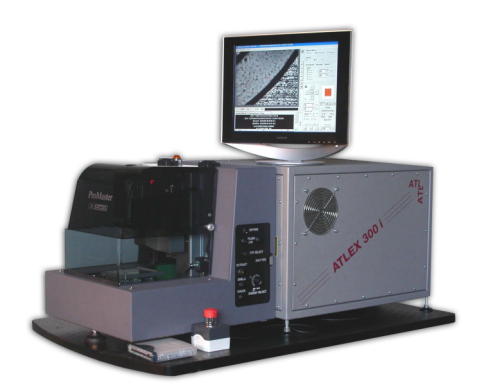
ProMaster turnkey workstation (based on ATLEX) sets a new standard in micromachining

Very short excimer laser pulses of 10 - 20 mJ with equivalent Megawatt peak power are used in rapid prototyping, micromachining systems for processing micro-electronic and bio-medical components in materials like polymers, inorganics (glass), thin metals, plastics and ceramics.