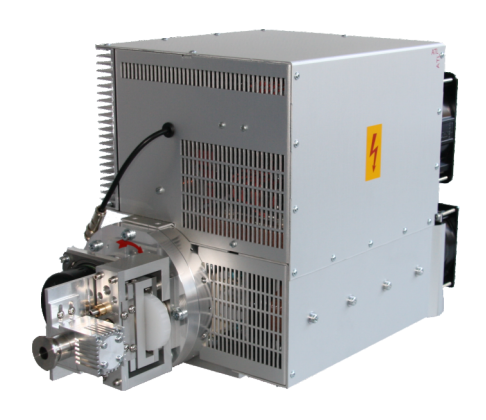
Solid state switch