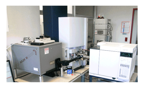
APLI source coupled to a micrOTOF II™

APLI (Atmospheric Pressure Laser Ionization) is a breaking ionization method with unrivalled sensitivity and selectivity for demanding applications such as the determination of PAH at low concentrations, polymer research, etc..