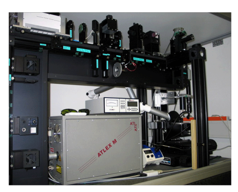
Micromachining System based on ATLEX-S-193 nm Short Pulse Excimer Laser

ATLEX-FBG 193 nm and 248 nm generates short pulses with a spatial coherence compatible for all types of fiber Bragg grating writing.