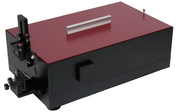
IRA-VISIR Scanning Autocorrelator