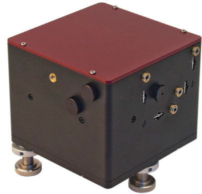
The AA-20DD optical unit